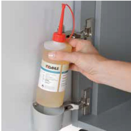
Environmentally friendly oil is always easy to access, included with all cross-cut models