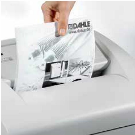
Standardised entry widths take all common paper sizes