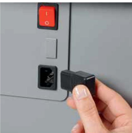
Detachable IEC power plug makes the document shredder quick and easy to move from A to B