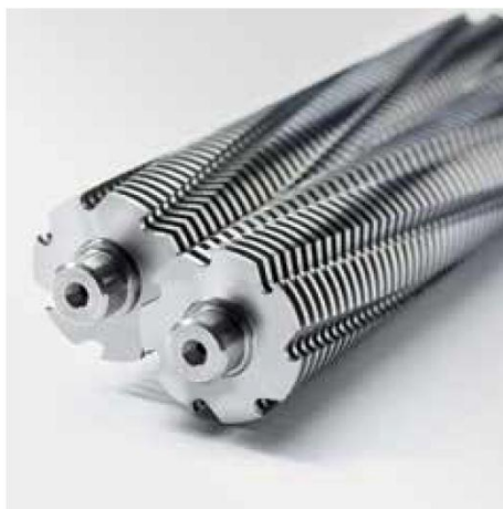
High-quality, solid-steel cutters in special steel for a guaranteed long service life