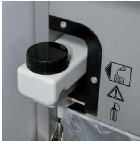
Integrated oil tank for controlled, automatic lubrication of the cross-cut cutters helps to lengthen service life while keeping performance constant