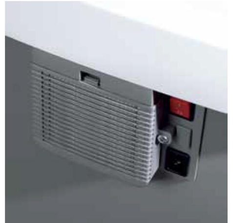
Unique DAHLE CleanTEC® filter system filters and effectively binds fine dust particles to create a better indoor environment.