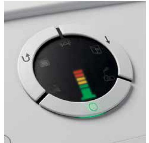
Paper quantity sensors prevent the document shredder from starting if too much has been fed in to avoid paper jams