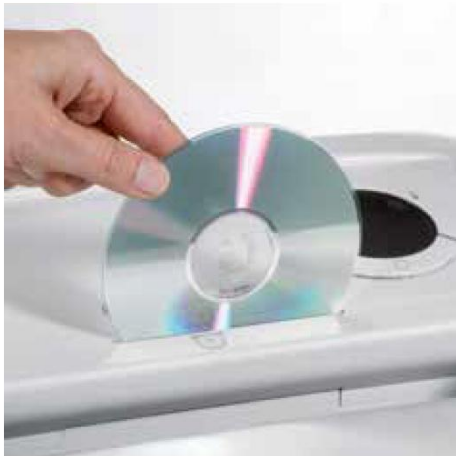
Separate feed opening for CDs, DVDs, cheque and credit cards guarantees reliable shredding of optical, magnetic and/or electronic data carriers